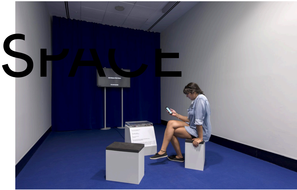
Networks of Trust 5th Istanbul Design Biennial