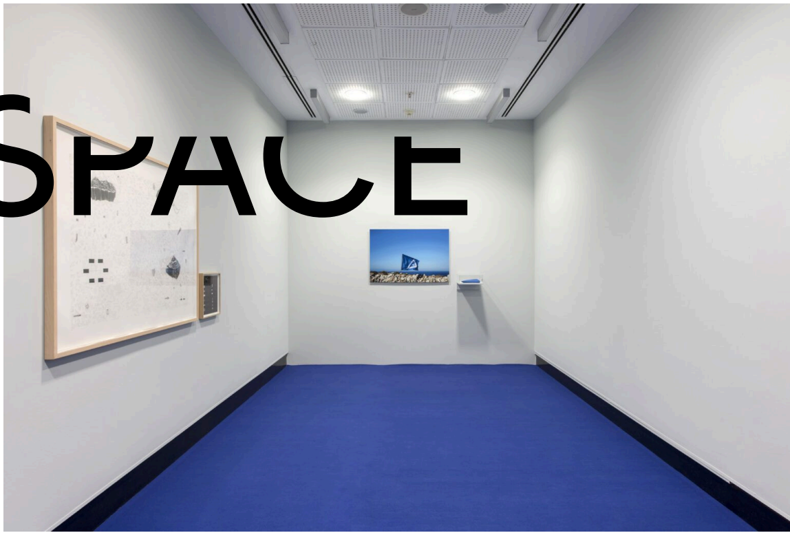
Networks of Trust 5th Istanbul Design Biennial