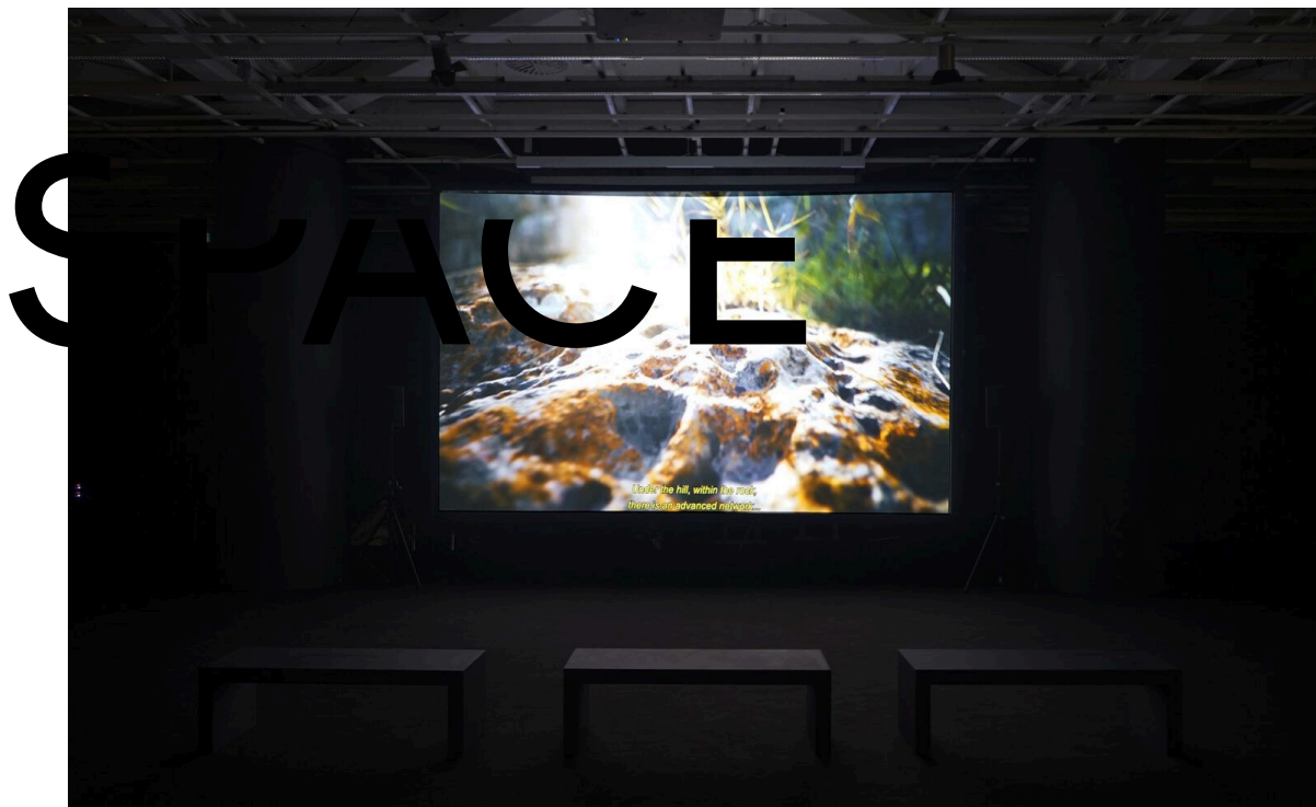
Data Garden (2020) Video, 11:30 min Solo exhibition at Onassis Stegi