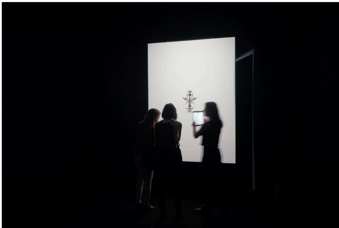
Augmented Reality portrait of an invisible plant AR App, 3D Model, Custom made AR Target Data Garden (2020), Solo exhibition at Onassis Stegi ©Kyriaki_Goni