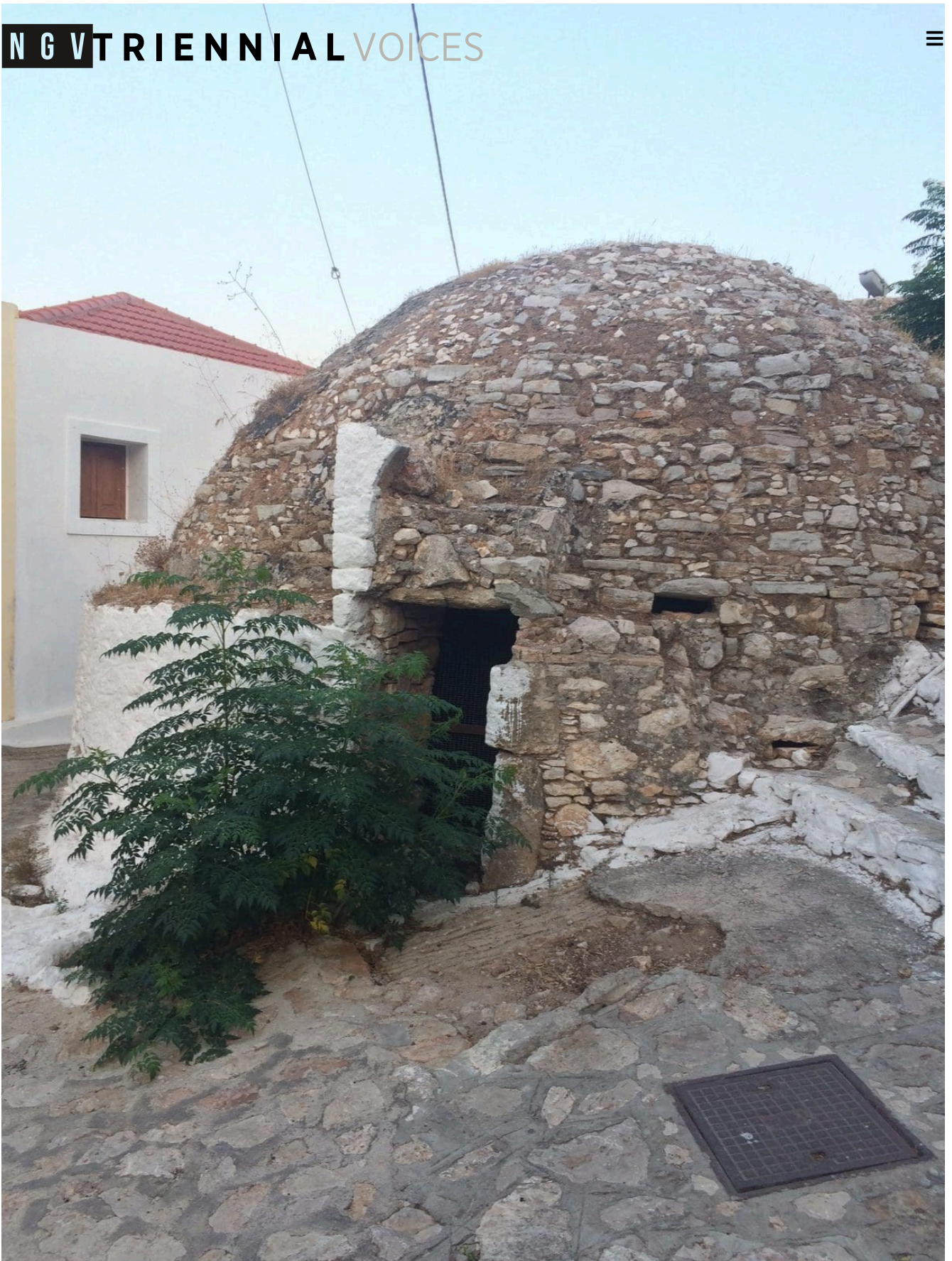
Fig. 3 Κύφη (kifi), round built construction where the shepherds used to stay during spring and summer while moving with their herds. Halki, 2017, © Kyriaki Goni