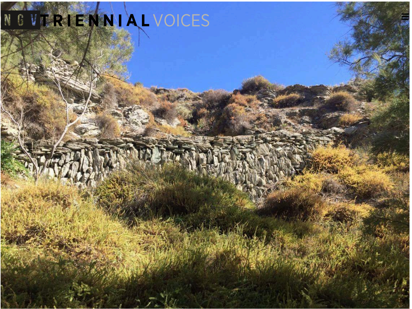
Fig. 4. Example of vertical dry wall stone. Folegandros 2017, © Kyriaki Goni