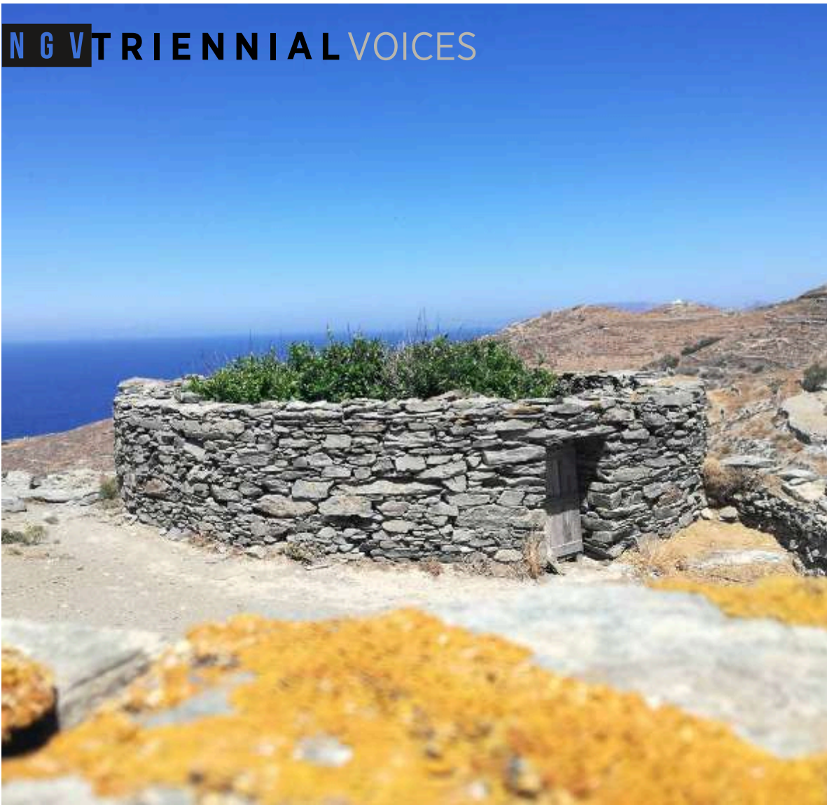
Fig.1 Περιβόλι (Perivoli or lemonhouse) built exclusively for protecting lemon trees from strong winds. Folegandros 2017