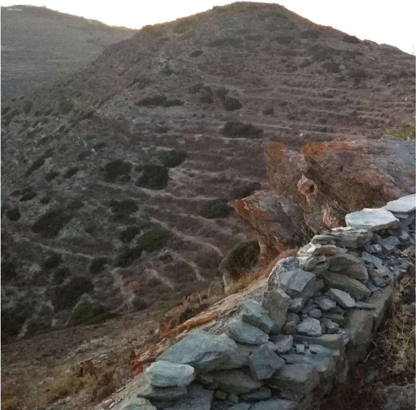
Fig. 5. Example of extended vertical dry wall stones. Folegandros 2017, © Kyriaki Goni

This demonstrated craftsmanship to protect and safeguard the community and the commons against the hardest conditions, being either the weather or the extreme isolation, justifies the islanders as the most suitable safeguards of any form of memory, as the most skilled builders of memory havens or datahavens.