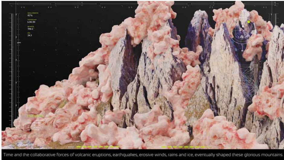
Kyriaki Goni, The Mountain-Islands Shall Mourn Us Eternally (Data Garden Dolomites), 2022. Video still. © Kyriaki Goni.

plants shapes landscapes over time. I was profoundly moved by Goni's installation, The Mountain-Islands Shall Mourn Us Eternally (Data Garden Dolomites) (2022).