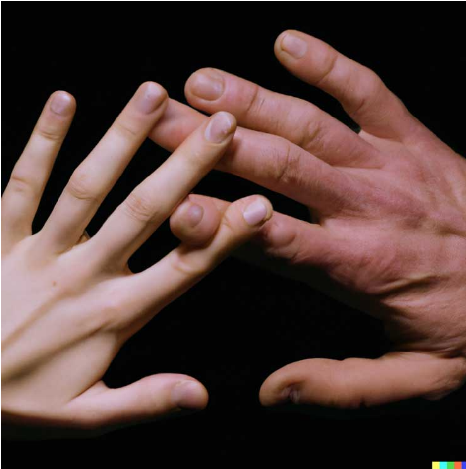
Kyriaki Goni, Perfect Love #couplegoals #aigenerated 2020, 2022. © DALL·E Kyriaki Goni.

user, it was interesting seeing very personal, intimate moments between couples being uploaded, with the hashtag #couplegoals. I eventually collaborated with a programmer, who wrote a small script that, over five days, scraped the whole of Instagram looking for images with the hashtag #couplegoals. I gathered 20,000 images. At the beginning, I was thinking of curating them, cutting them in a new narrative. But I decided to show them as they were in a long, tiring video, without intervening, and keeping the captions and hashtags as a long, newsreel-style caption. It's one hour long, and you're not supposed to watch the whole thing: you're supposed to get tired of the infinite scrolling. It was interesting to expose this need to make public something so intimate, and, at the same time, this time-consuming habit of observing the lives of others online.