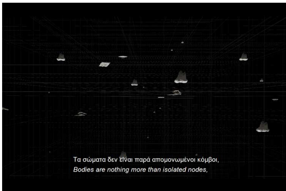
Kyriaki Goni, The Portal or Let's Stand Still for the Whales, 2020. Still image. © Kyriaki Goni.

VS: The current group show Modern Love (or Love in the Age of Cold Intimacies) , at EMST, the National Museum of Contemporary Art in Athens, also looks fascinating, exploring technology and its impact on relationships. Tell us about the two works there.